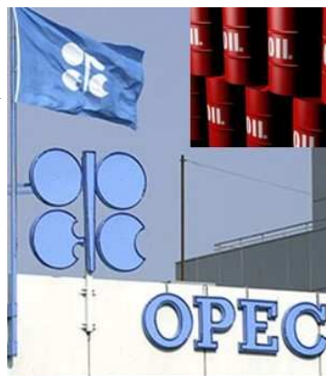
(newsfromrussia.com) "OPEC is free from blame for the skyrocketing oil prices"

Although I do agree with His Excellency, President Chavez, that it is the attachment of oil to the U.S. dollar that is causing the great instability in the oil market, I believe it is fallible to link oil to